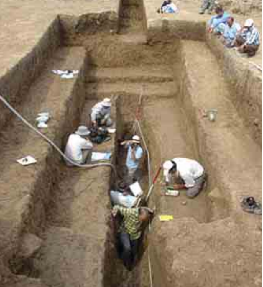
An excavation team at the Gorgan Wall. The most recent expeditions have been conducted by an Iranian-British team in late 2007-early 2008.

The first serious expedition to the site occurred in 1971 by an archaeological team led by Dr. Kiani. The second thorough analysis of the structure was made by an archaeological survey team in the 1990s. This was part of the activities related to the development of the Golestan Dam. The most recent expedition occurred in early 2008 by an international archaeological team composed of special-