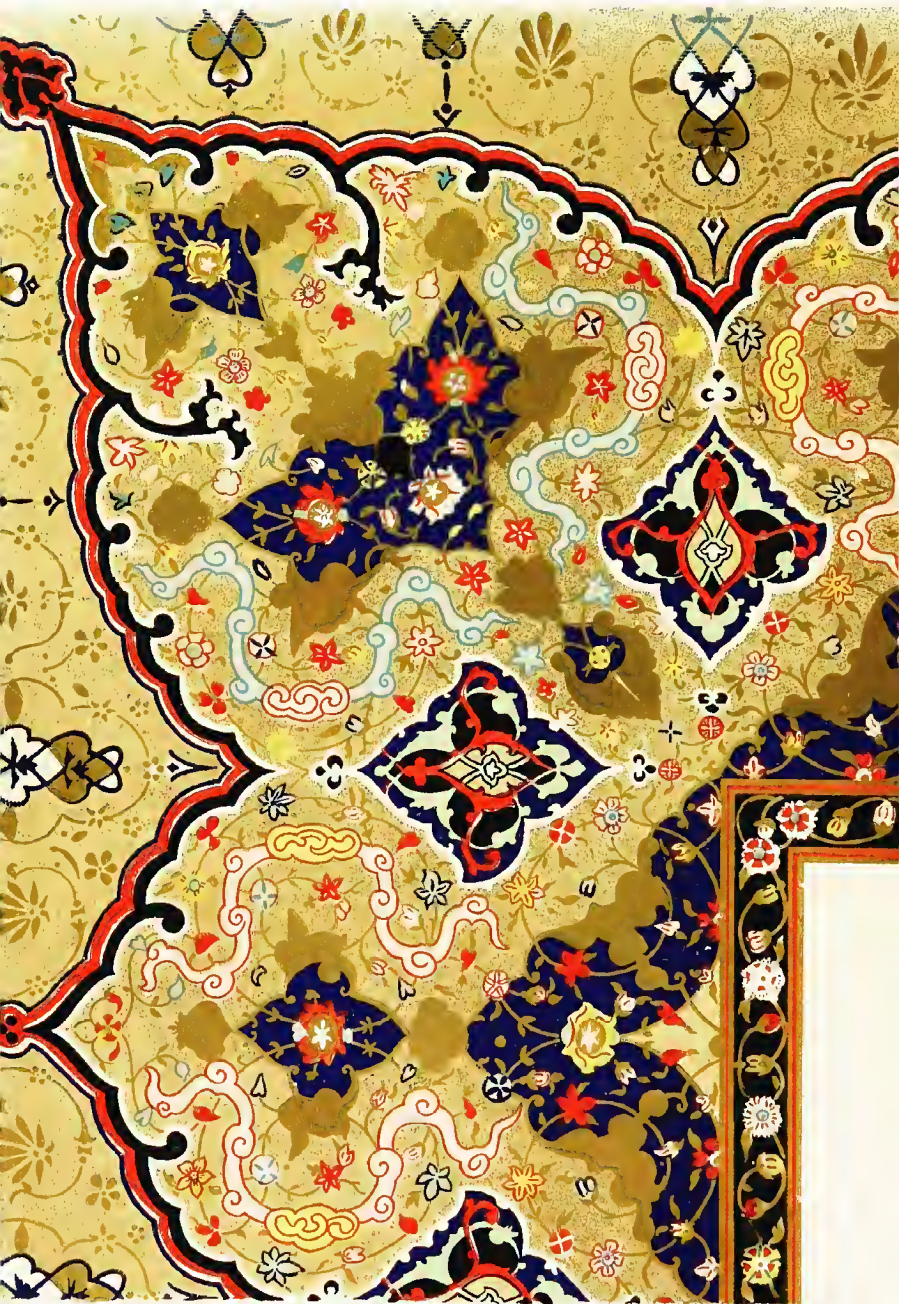
FAC SIMILE OF A PORTION OF THE TITLE PAGE OF AN ILLUMINATED. "SHĀH NĀMAH" (SEE PREFACE) .