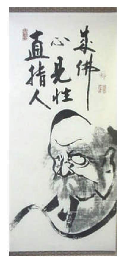
Photo 3. 1 Japanese scroll calligraphy of Bodhidharma By Hakuin Ekaku 白隠 慧鶴, 1686–1769

—— Bodhidharma is said to be a blue-eyed Persian 碧眼胡僧 (Hekigan-kosō) in Zen tradition. "Blue-eyed Persian" means Hellenized Persian, and/or a Persian who has much knowledge about western culture. Mithra's magi are such Persians.